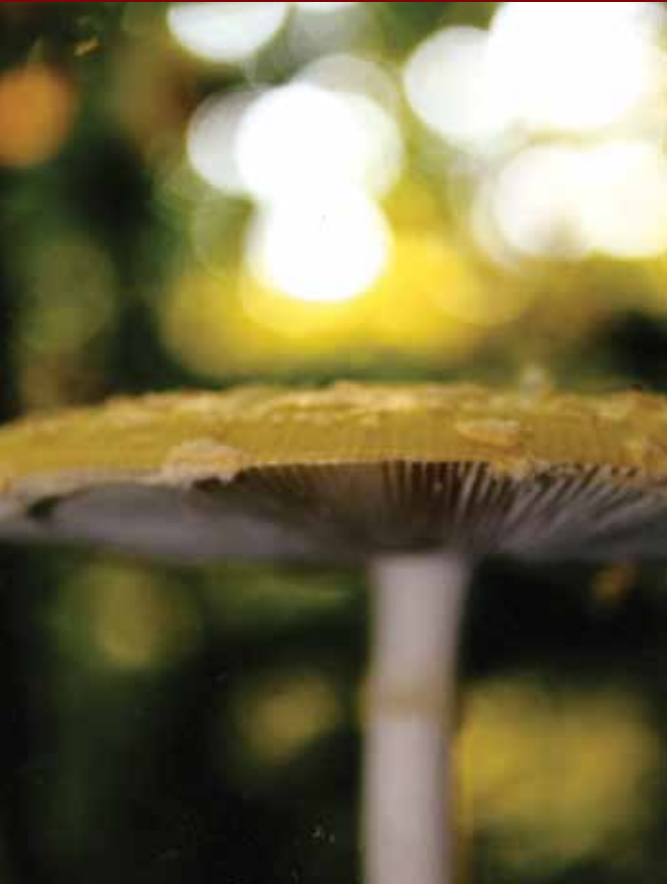
1ST A Different Point of View Tyson Diedrich—Menomonie, Wisconsin