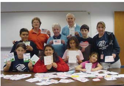
Holding up greeting cards they made to send overseas are members of Shiocton Branch 882 and the Boys and Girls Club of Fox Valley.

If you have already put together a project or have a great idea to lift the spirits of military personnel or their families, share it with us by sending an e-mail to bennyb@nmbfrat.org . ♦